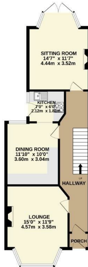
GROUND FLOOR 611 sq.ft. (56.8 sq.m.) approx.